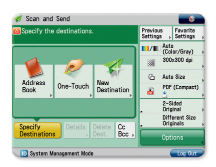
Universal Send Screen

Universal Send now offers an expanded range of file formats, including High Compression PDF/XPS, Adobe PDF Reader Extensions. Searchable PDF. and Encrypted PDF.